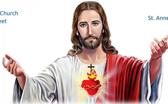
St. Anne's Mission Church 375 Main Street Andes NY 13731