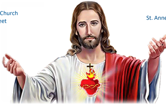
St. Anne's Mission Church 375 Main Street Andes NY 13731