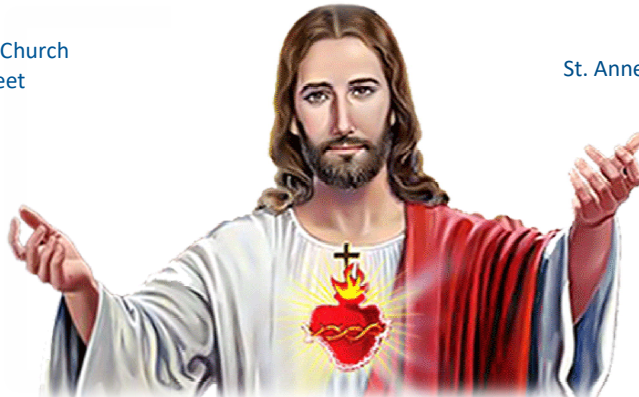
St. Anne's Mission Church 375 Main Street Andes NY 13731