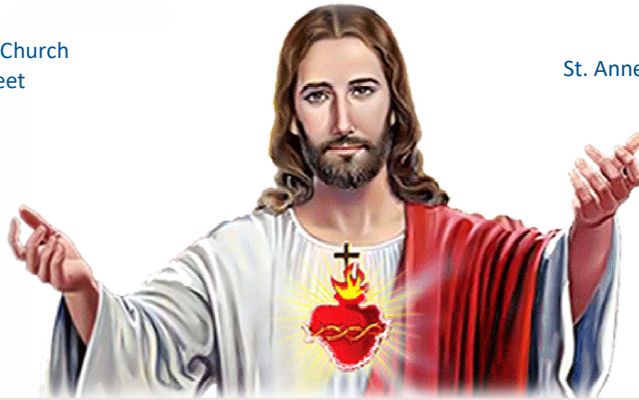
St. Anne's Mission Church 375 Main Street Andes NY 13731