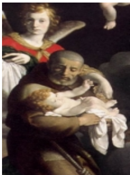
Saint Felix of Cantalice May 18, 1515 to May 18, 1587

Starting on Mother's Day the Altar Rosary Society will hold a baby bottle campaign to support the New Life Maternity Center in Hudson, NY. This home takes expectant mothers and their children in times of crisis. It is a privately run Catholic organization. The home helps women regain their independence in a safe and supportive environment. Women live there with their children until they are ready to care for their family independently. Services are offered per the individual needs of their clients. This organization is run by donations. Please consider donating and continue to pray for these women and children. Our campaign will continue through Father's Day. Thank you and may God bless each of you for your