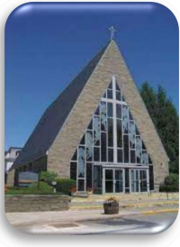
Sacred Heart Church 543 Main Street Margaretville NY 12455