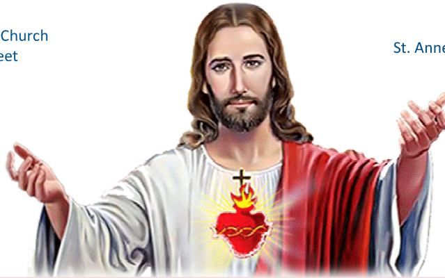
St. Anne's Mission Church 375 Main Street Andes NY 13731