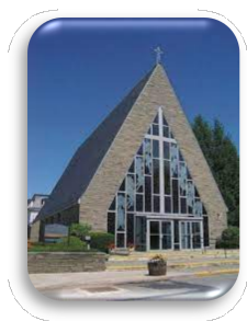
Sacred Heart Church 543 Main Street Margaretville NY 12455