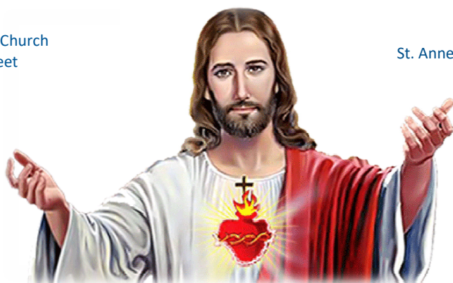
St. Anne's Mission Church 375 Main Street Andes NY 13731