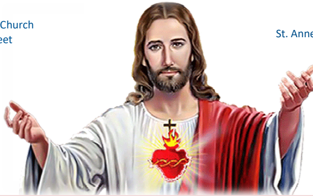
St. Anne's Mission Church 375 Main Street Andes NY 13731