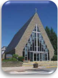
Sacred Heart Church 543 Main Street Margaretville, NY 12455