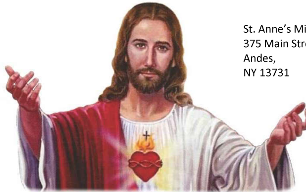
St. Anne's Mission Church 375 Main Street, Andes, NY 13731