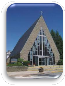
Sacred Heart Church 543 Main Street Margaretville, NY 12455