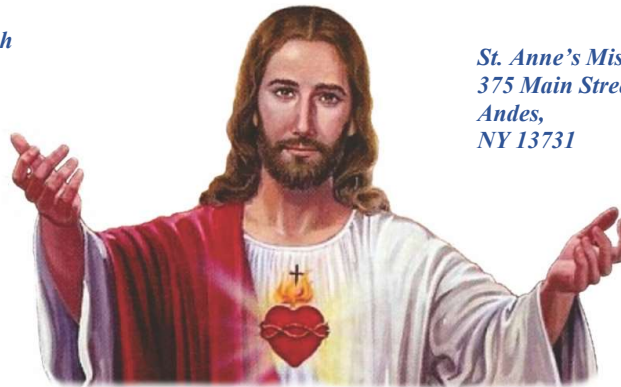
St. Anne's Mission Church 375 Main Street, Andes, NY 13731