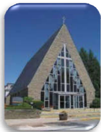
Sacred Heart Church 543 Main Street Margaretville, NY 12455