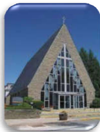
Sacred Heart Church 543 Main Street Margaretville, NY 12455