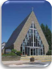
Sacred Heart Church 543 Main Street Margaretville, NY 12455