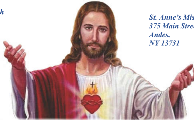
St. Anne's Mission Church 375 Main Street, Andes, NY 13731