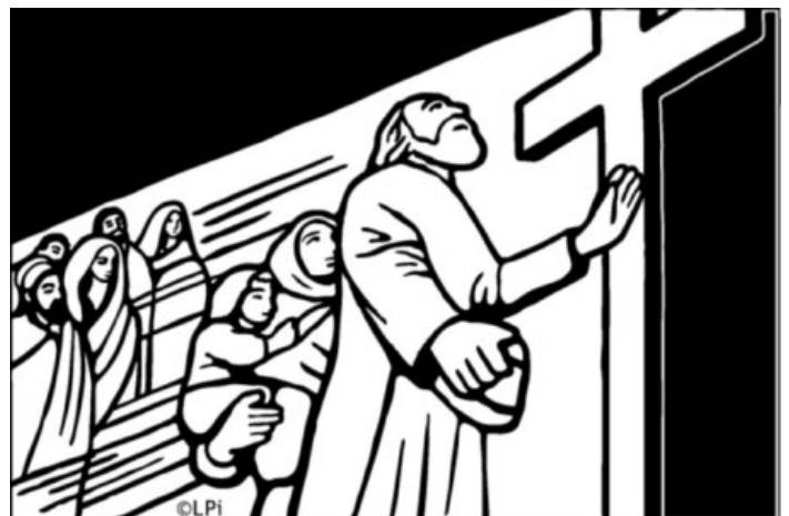
An inward transformation occurs in a person who decides to follow Jesus Christ.

Please leave your gifts of non-perishable food at the entrance to our churches. They will be gratefully distributed to our Food Pantries in Margaretville and Andes