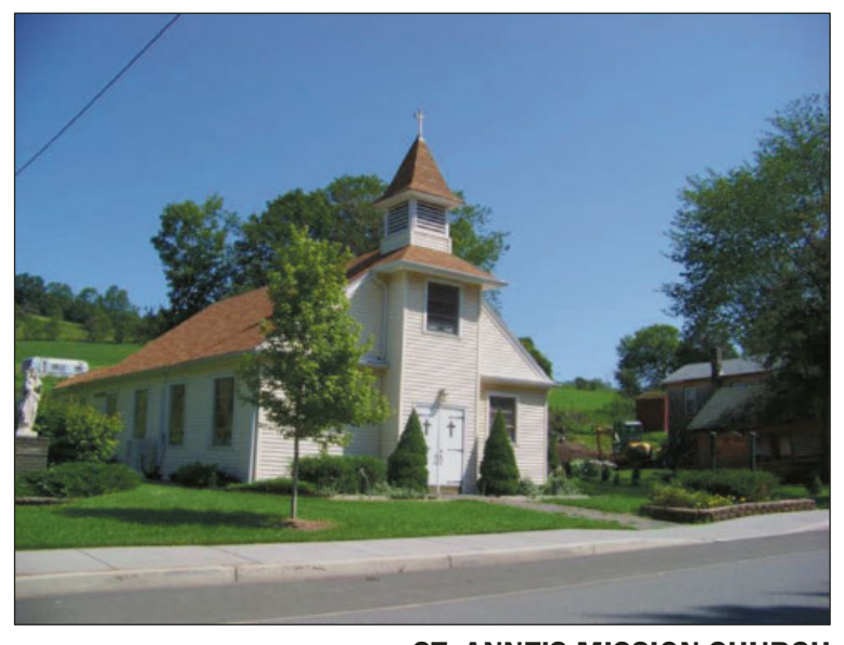
ST. ANNE'S MISSION CHURCH 375 Main Street, Andes, NY 13731 All Correspondence: Sacred Heart Parish, Margaretville NY

<u>Parish Email</u> shcatholicchurch@icloud.com