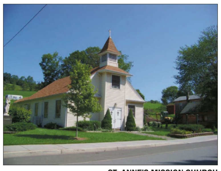
ST. ANNE'S MISSION CHURCH 375 Main Street, Andes, NY 13731 All Correspondence: Sacred Heart Parish, Margaretville NY

<u>Parish Email</u> shcatholicchurch@icloud.com