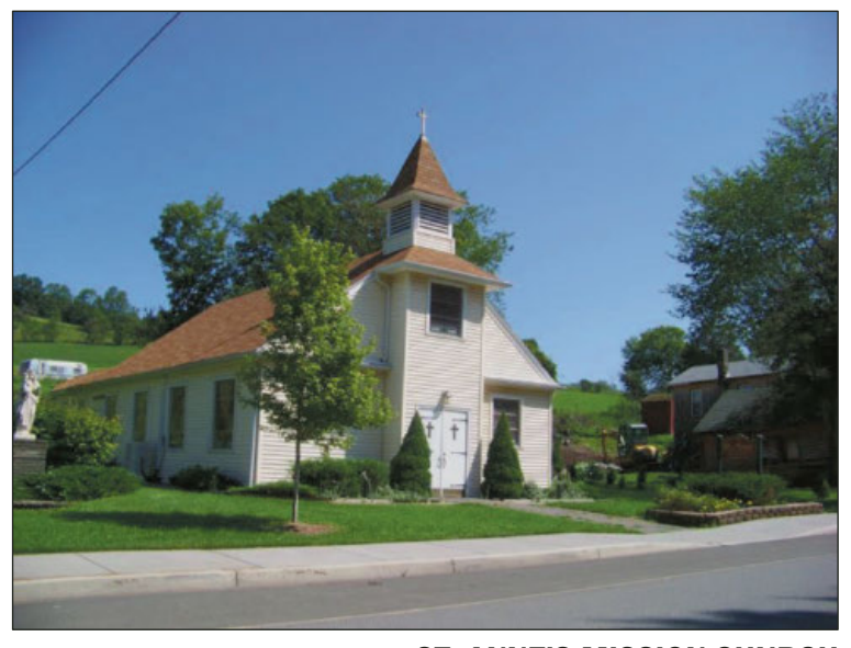
ST. ANNE'S MISSION CHURCH 375 Main Street, Andes, NY 13731 All Correspondence: Sacred Heart Parish, Margaretville NY

<u>Parish Email</u> shcatholicchurch@icloud.com