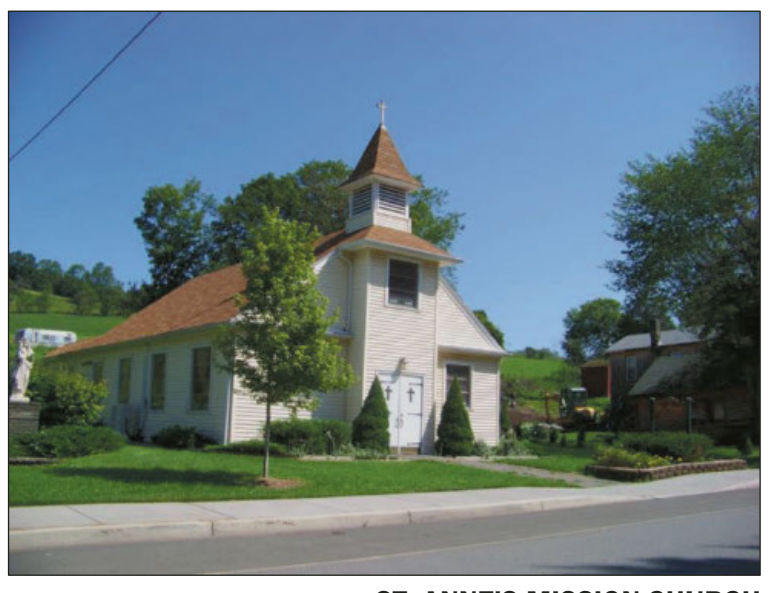
ST. ANNE'S MISSION CHURCH 375 Main Street, Andes, NY 13731 All Correspondence: Sacred Heart Parish, Margaretville NY

<u>Parish Email</u> shcatholicchurch@icloud.com