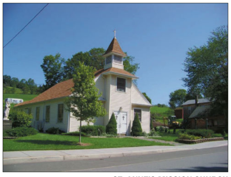
ST. ANNE'S MISSION CHURCH 375 Main Street, Andes, NY 13731 All Correspondence: Sacred Heart Parish, Margaretville NY

<u>Parish Email</u> shcatholicchurch@icloud.com