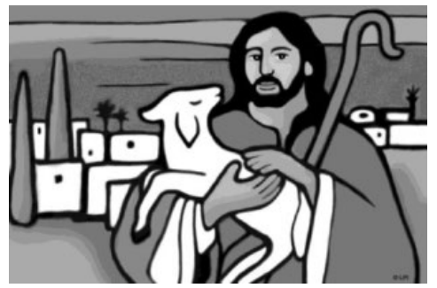
"I am the good shepherd, says the Lord"

We have to trust the voice of God, the true Shepherd, even when it does not mirror what we want and what others may believe. Faith goes way beyond feeling and involves a radical trust in Someone who can lead us and form us. At day's end, if we do not know to find our way home, we will be truly lost.