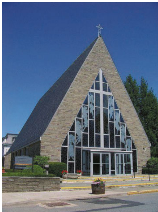
SACRED HEART CHURCH

All Correspondence: Sacred Heart Parish, Margaretville NY