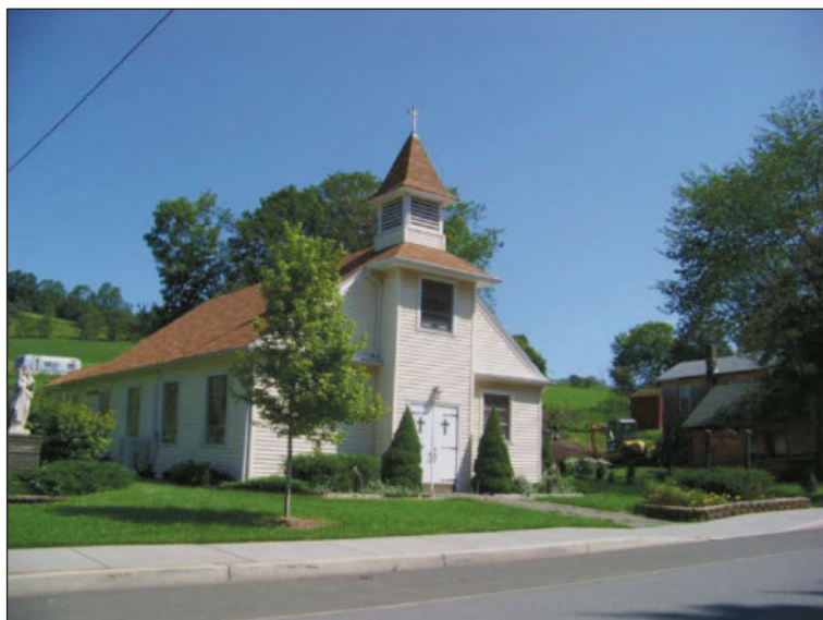
ST. ANNE'S MISSION CHURCH

Parish Email shcatholicchurch@icloud.com