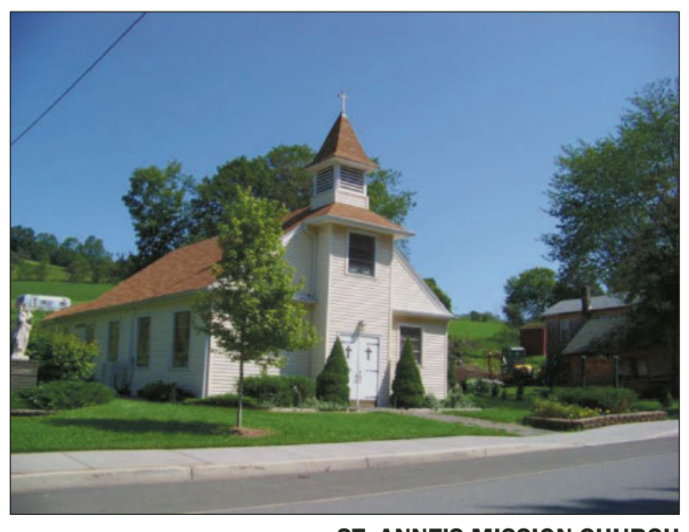
ST. ANNE'S MISSION CHURCH 375 Main Street, Andes, NY 13731 All Correspondence: Sacred Heart Parish, Margaretville NY

<u>Parish Email</u> shcatholicchurch@icloud.com