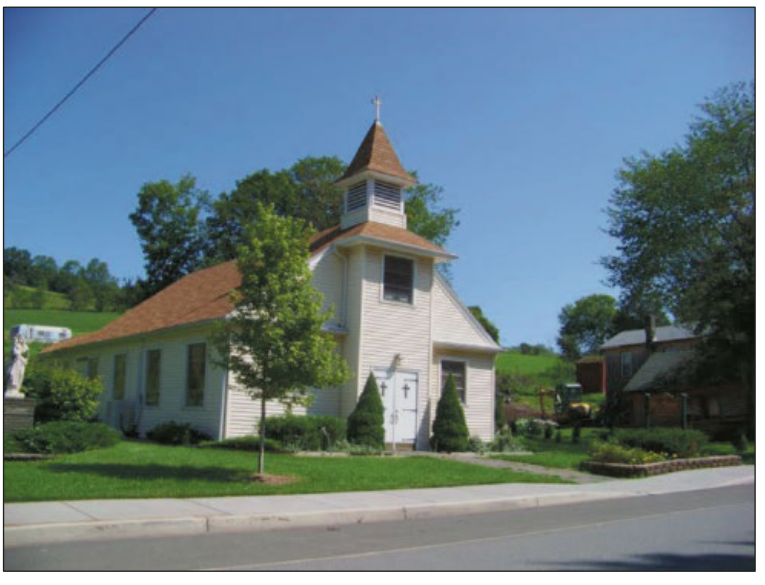
ST. ANNE'S MISSION CHURCH 375 Main Street, Andes, NY 13731 All Correspondence: Sacred Heart Parish, Margaretville NY

<u>Parish Email</u> shcatholicchurch@icloud.com