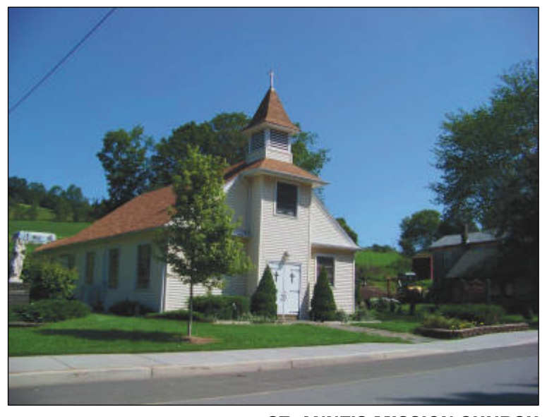
ST. ANNE'S MISSION CHURCH 375 Main Street, Andes, NY 13731 All Correspondence: Sacred Heart Parish, Margaretville NY

<u>Parish Email</u> shcatholicchurch@icloud.com