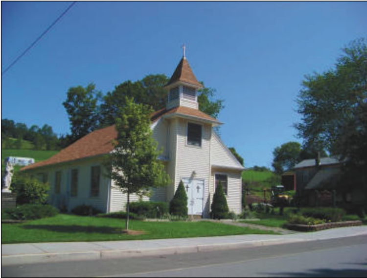
ST. ANNE'S MISSION CHURCH

Parish Email shcatholicchurch@icloud.com