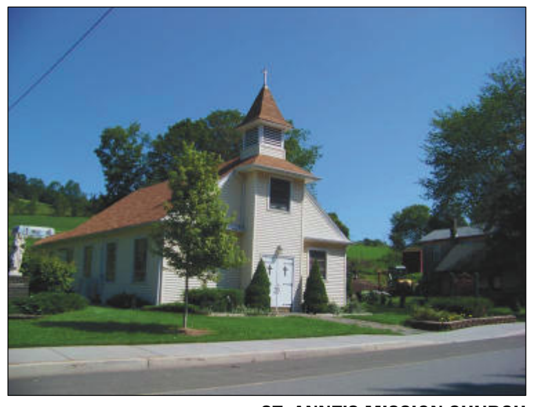
ST. ANNE'S MISSION CHURCH 375 Main Street, Andes, NY 13731 All Correspondence: Sacred Heart Parish, Margaretville NY

<u>Parish Email</u> shcatholicchurch@icloud.com