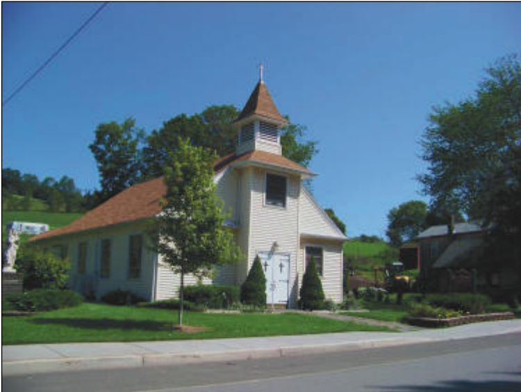
ST. ANNE'S MISSION CHURCH

Parish Email shcatholicchurch@icloud.com