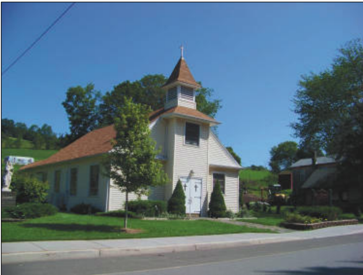
ST. ANNE'S MISSION CHURCH

Parish Email shcatholicchurch@icloud.com